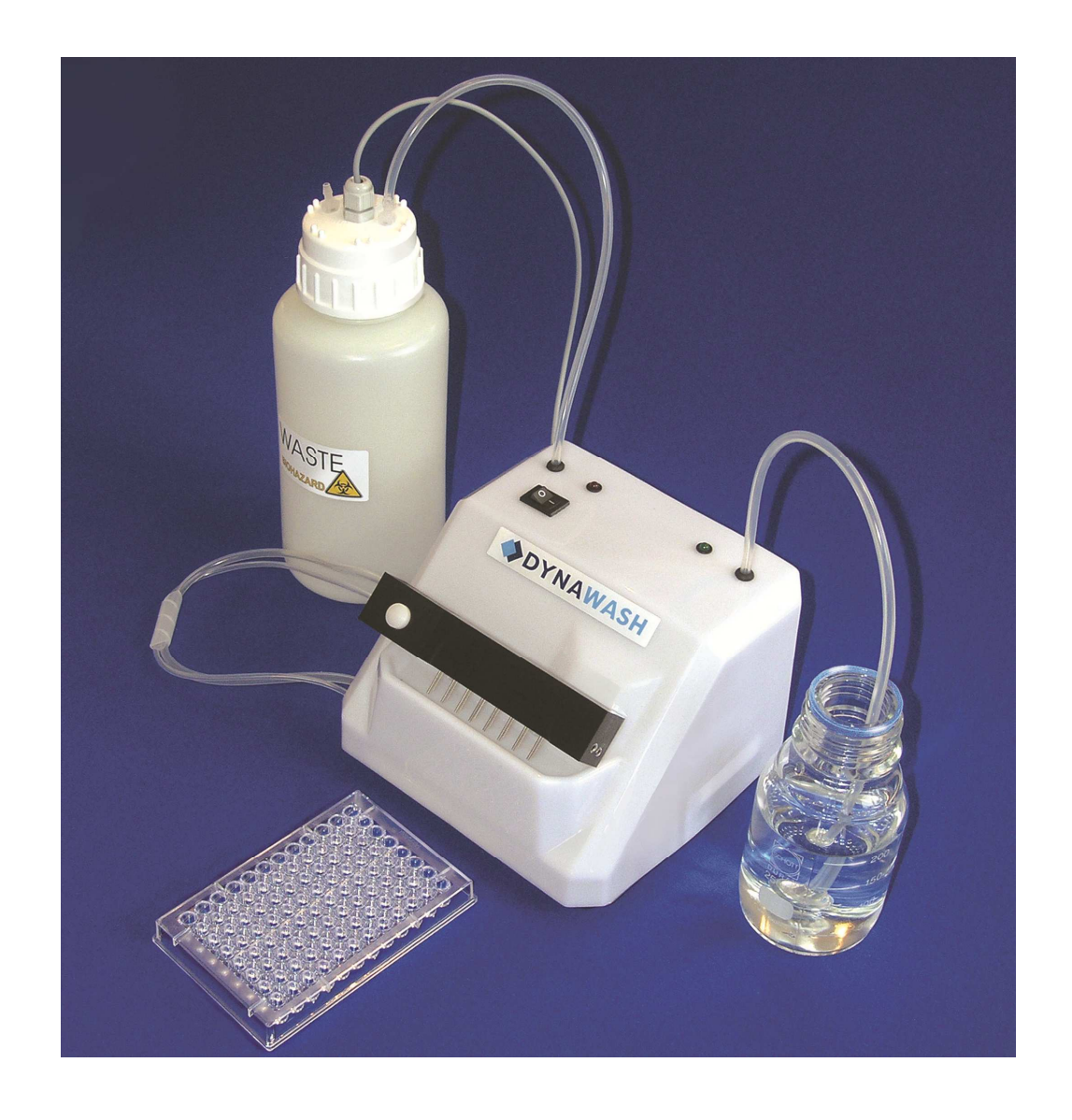
Operation and Maintenance Guide