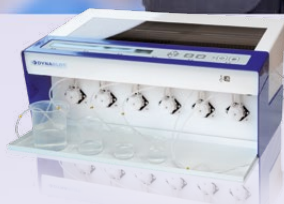
◆ DYNABLOT PLUS