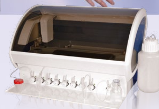
◆ DYNABLOT AUTOMATIC