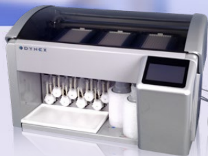
◆ DYNABLOT HEAT