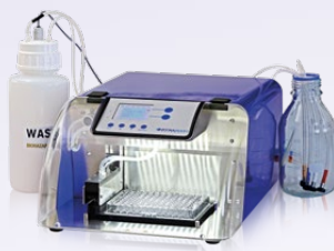
◆ DYNAWASH AUTOMATIC